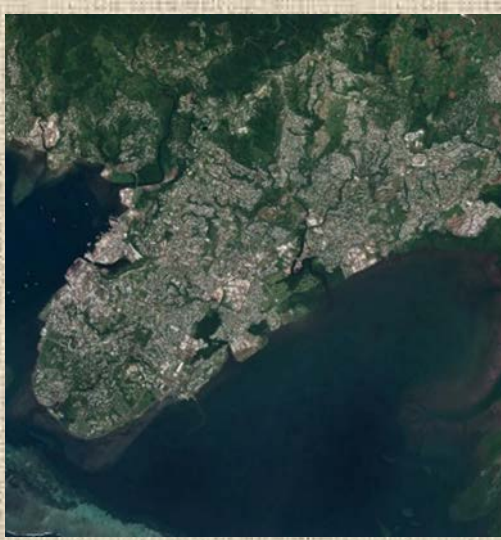
Suva Peninsula Today.