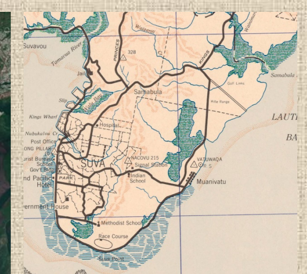
Suva Peninsula 1943 (US Army).