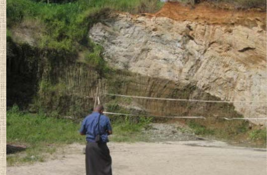
Road cut through the Veisari sandstone.

[The island motifs used here is a collage of island designs that are representative of the Pacific Region. Individual motifs are based on various popular island designs. Images have been downloaded from the "Tapa Cloths from the Pacific and Artwork" website: www.tapapacifica.com, accessed 10 November 2016. The use of the images are gratefully acknowledged.]